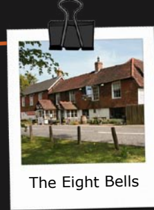
The Eight Bells

Two Free Photo Workshops! 24th & 25th June